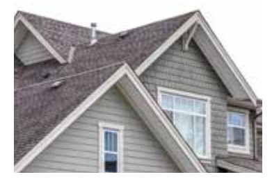
Smart Home Tech Installation and Setup Services